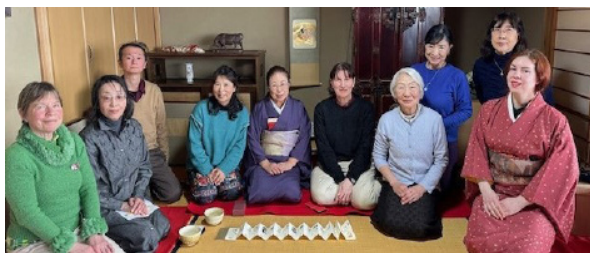
SGG Members participated in a Koh-Do or incense ceremony on Feb 6th

In Japanese history, Koh-Do was popular with the samurai and court class as well as others. Intellectuals such as writers, artists, affluent merchants, and landowners started to adopt its formalities and incense had a great influence on calligraphy, literature, and tea ceremony, making it an intangible and spiritual asset at the time. There will be opportunities to do this again for SGG members.