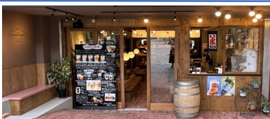
CHAPORTE is just a one minute walk from Atami station

*If you are over 50, you can get a 4,000 yen subsidy for the vaccination of shingles. There are two types of vaccines but you can get the subsidy only once. Please use the application through the Atami City homepage.